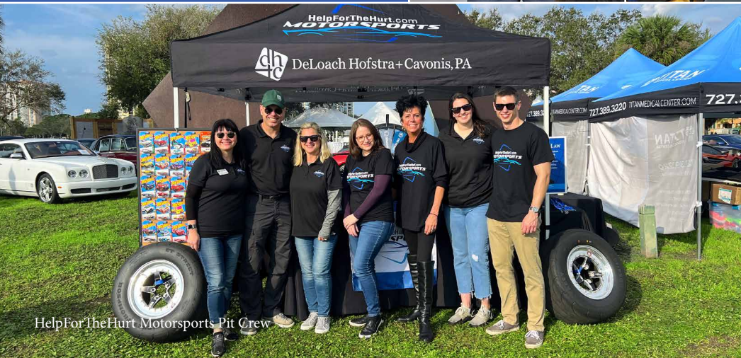
HelpForTheHurt Motorsports Pit Crew