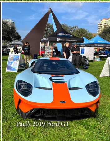
Paul's 2019 Ford GT