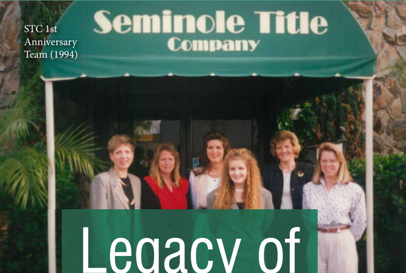
STC 1st Anniversary Team (1994)

Injury Law + Estate Planning + Elder Law + Real Estate & Association Law + Litigation + Probate