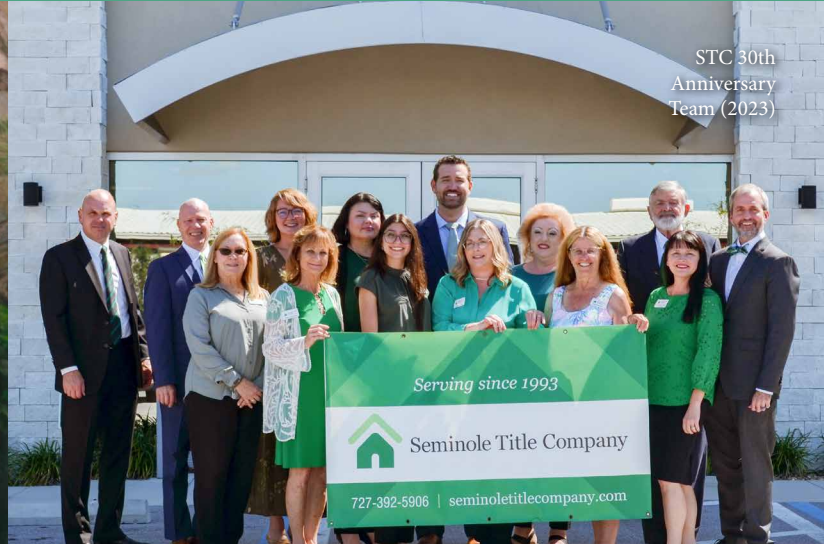
STC 30th Anniversary Team (2023)